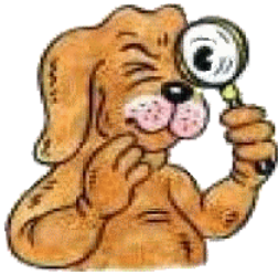
“Accountability” Glendale’s Watchdog