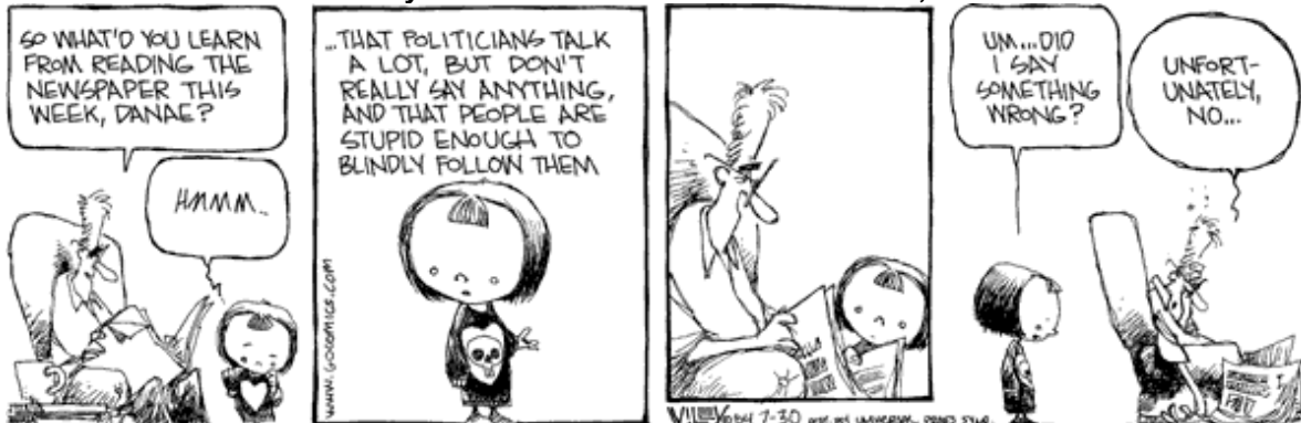
A reality hits home