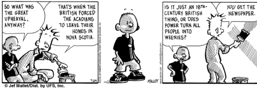
Do City Council members become weenies, too?