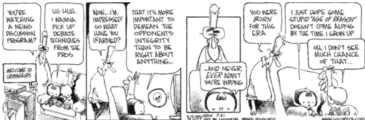
Kill the Messenger