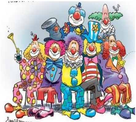
On the dais