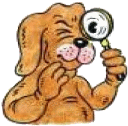
“Accountability” Glendale’s Watchdog