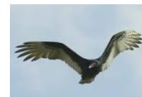
A Glendale Vulture swooping in for the rot

City Manager Shares his management style with the Council