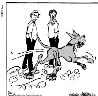
"It must be a fire... for dinner he's more of a blur."

The engines and trucks roll at lunchtime