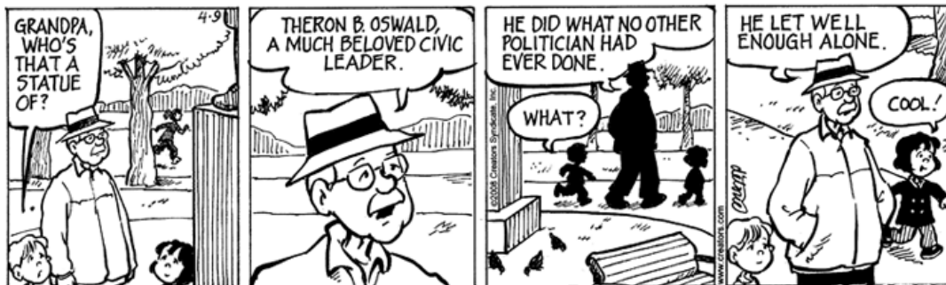
Grandpa - Does that apply to Glendale?