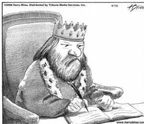
“Dear diary: Pillage, conquer, scheme, poison — same old thing. Plus, my new robe makes me look fat!”