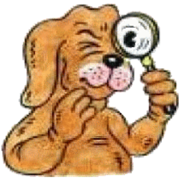
“Accountability” Glendale’s Watchdog