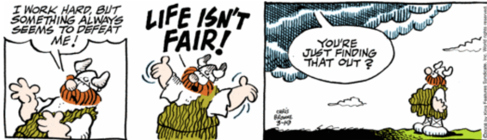
Hagar the Horrible