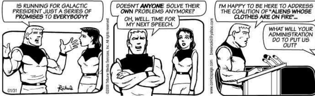
Brewster Rockit on the campaign Trail