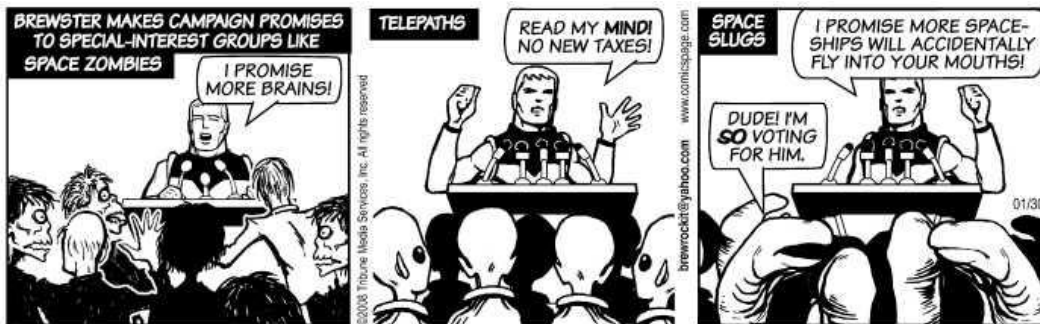
Brewster Rockit on the Campaign Trail