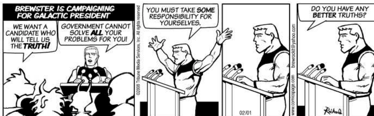
Brewster Rockit -- Ain't that the Truth