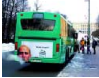
New Beeline Advertising