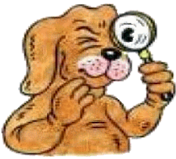
"Accountability" Glendale's Watchdog