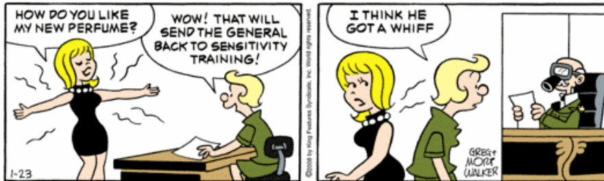
Guess who Gen. Halftrack represents. From a reader who misses the political humor