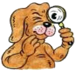
"Accountability" Glendale's Watchdog