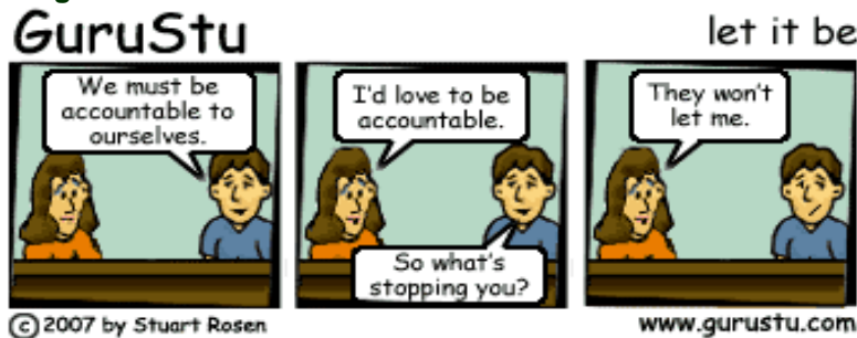
You can be 'Accountable' without permission