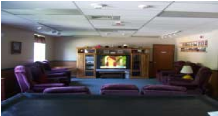
Typical Fire Department Recreation Room

The Glendale Police cars are carrying defibrillators and they are able to get to an emergency medical scene in 1-2 minutes whereas the fire department takes up to 10 minutes according to their own records. If the City Council cared about the public rather than the comfort of the firefighters, they would heed the information provided by retired Police Chief Philpott and go one step further and set up shifts that are more in line with public need. We don't need to supply sleeping quarters, Barcaloungers and big screen TVs and the finest cooking appliances money can buy.